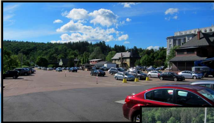
Acres of Parking