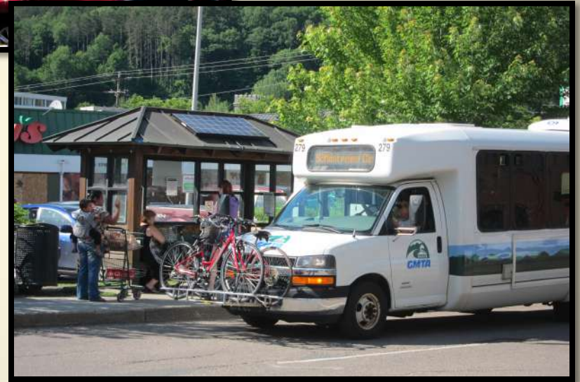
Fixed Route Fixed Schedule Bus