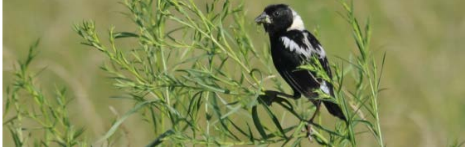
John Hall / Vermont Fish And Wildlife

Vermont Public: Vermont just set a new goal for conserving land: Here's what's next. -"The law calls for an inventory of land that's conserved now. And it calls for public input on a plan for how to get to 30 by '30 and 50 by '50... Over the next 1 ½ years, the Vermont Housing and Conservation Board will work with the Agency of Natural Resources to inventory the state's already conserved lands and make a plan for how to reach the new conservation goals." <u>Read the full article here.</u>