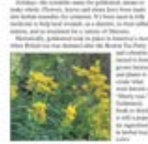
Goldenrod is a common wildflower in Vermont.

Goldenrod is a common wildflower in Vermont. It is a member of the Asteraceae family and is known for its bright yellow flowers. Goldenrod is a useful wildflower because it is a good source of nectar for bees and other pollinators. It is also a good source of food for many insects, including butterflies. Goldenrod is a hardy plant that can grow in a variety of soil conditions. It is a common sight in meadows, fields, and along roadsides.